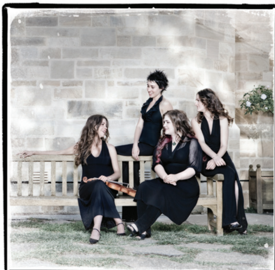
Australian String Quartet

Songbirds Friday 4 June Elder Conservatorium Jazz Orchestra Dusty Cox Director The Elder Conservatorium's internationally acclaimed 'Jazz Orchestra' will be joined by four outstanding undergraduate female singers in a swinging program of jazz standards and ballads.